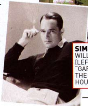
SIMPLY DASHING WILLIAM HAINES (LEFT); HIS “GARDEN ROOM,” THE WINFIELD HOUSE, LONDON.